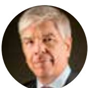
Prof. Paul Romer , NYU (USA)

His research foci are Contemporary Peacemaking by European Actors, International and European debates, International mediation and conflict resolution