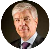
Prof. Paul Romer , Professor by Special Appointment

Prof. Paul Romer from NYU is the 2018 Nobel Prize Laureate in Economics, and one of the world's most inspiring thinkers in his field. Prof. Romer is a staunch supporter of the IGS 3 and has agreed to lead the School's excellent cohort of visiting scholars.