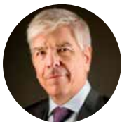
Prof. Paul Romer , NYU (USA)

One of the most brilliant and stimulating thinkers in the world today, engaged in various activities during his two visits with us: conducted workshops for outstanding students and young faculty, delivered a lecture to the Friends of TAU, launched our Excellence Scholarship Program, participating in the Cyber week and a lot more.